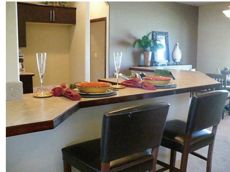
KITCHEN BREAKFAST BAR

*PHOTOS OF PRIOR MODEL, SUBJECT TO CHANGE AT ANYTIME