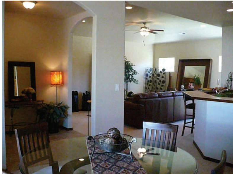
FROM DINING ROOM OVERLOOKING GREAT ROOM