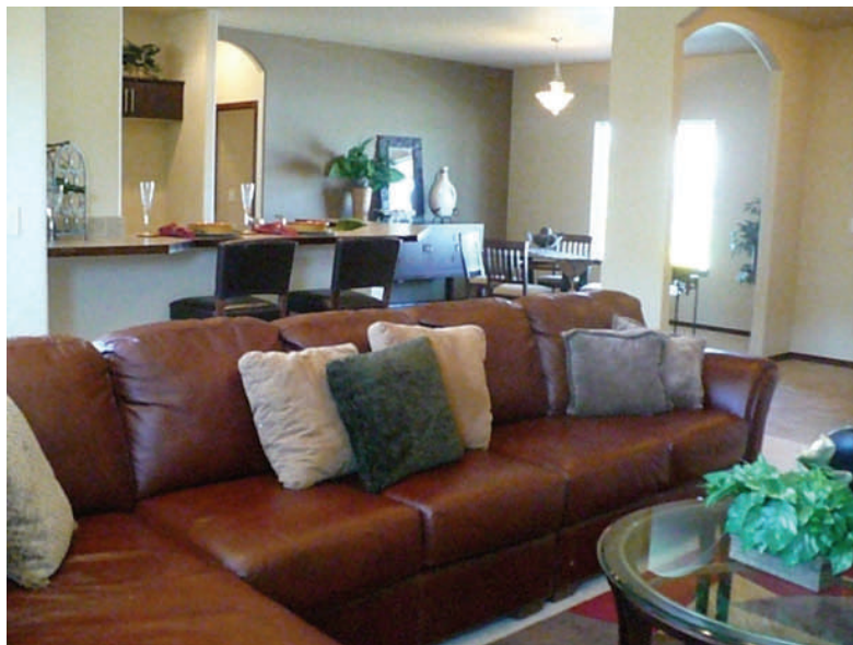
GREAT ROOM OVERLOOKING KITCHEN