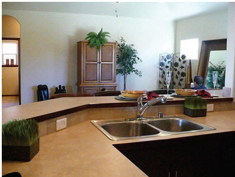
KITCHEN OVERLOOKING GREAT ROOM