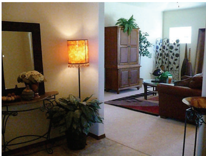
ENTRY INTO GREAT ROOM