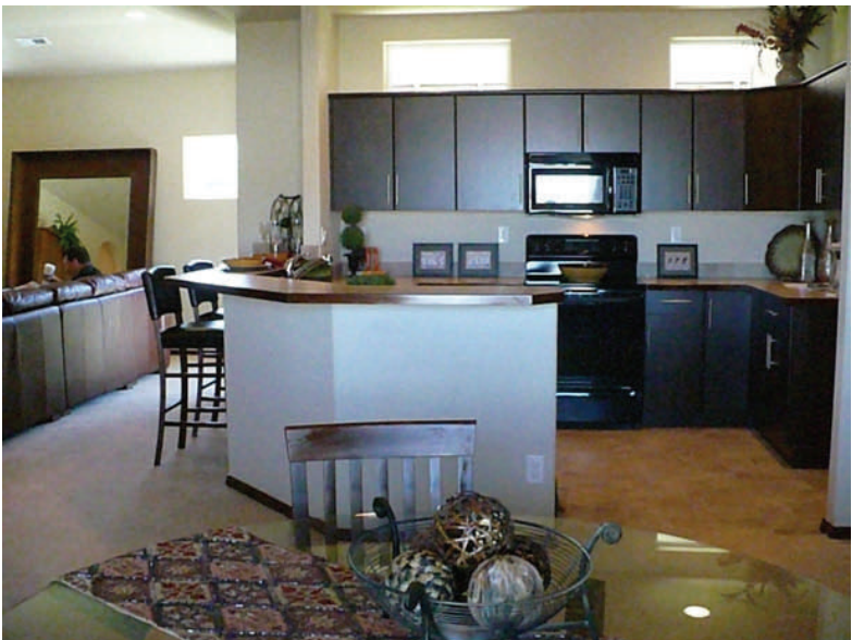
DINING ROOM OVERLOOKING KITCHEN