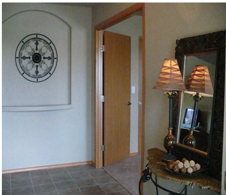
ENTRY WITH ART NICHE/ DEN WITH DOUBLE DOORS TO THE RIGHT