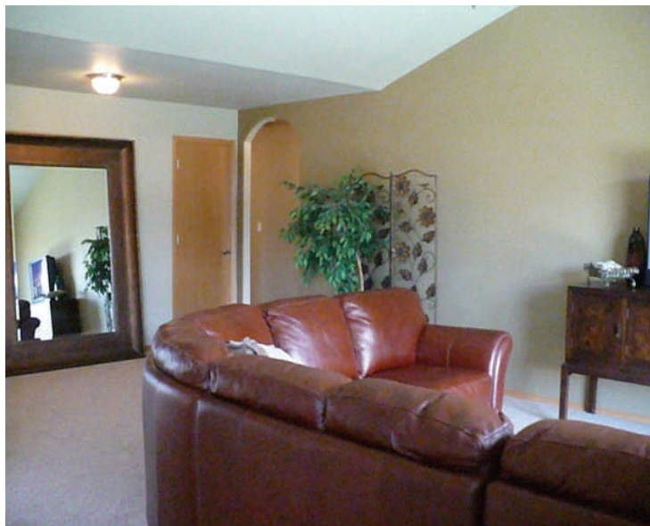
VAULTED GREAT ROOM