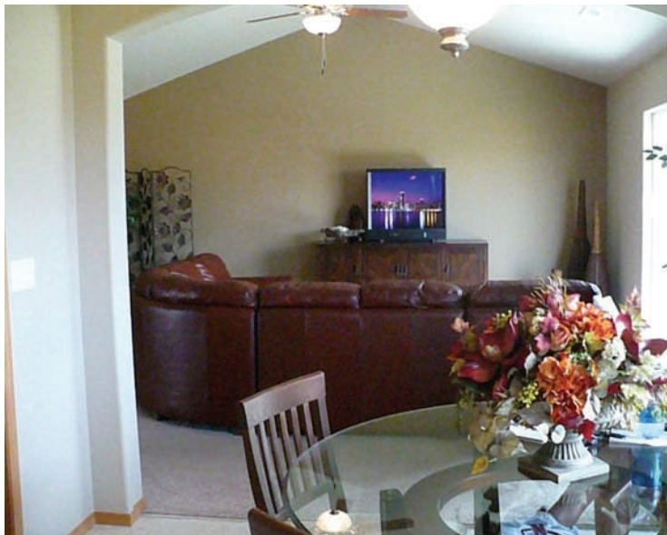
GREAT ROOM FROM DINING/KITCHEN